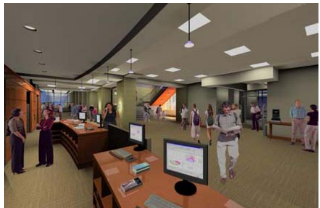
A computerized vision of the First Floor/Main Entryway